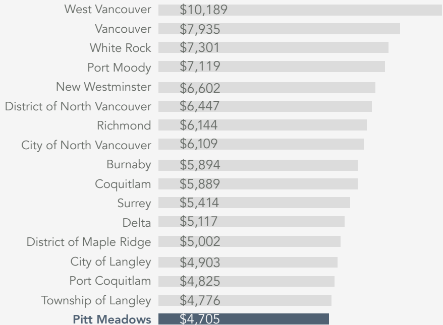
Note: This graph shows property taxes for the average single-family home.

Pitt Meadows likes to show the average amount of money people will actually pay. This makes it easier to understand and compare, as shown in the graph.