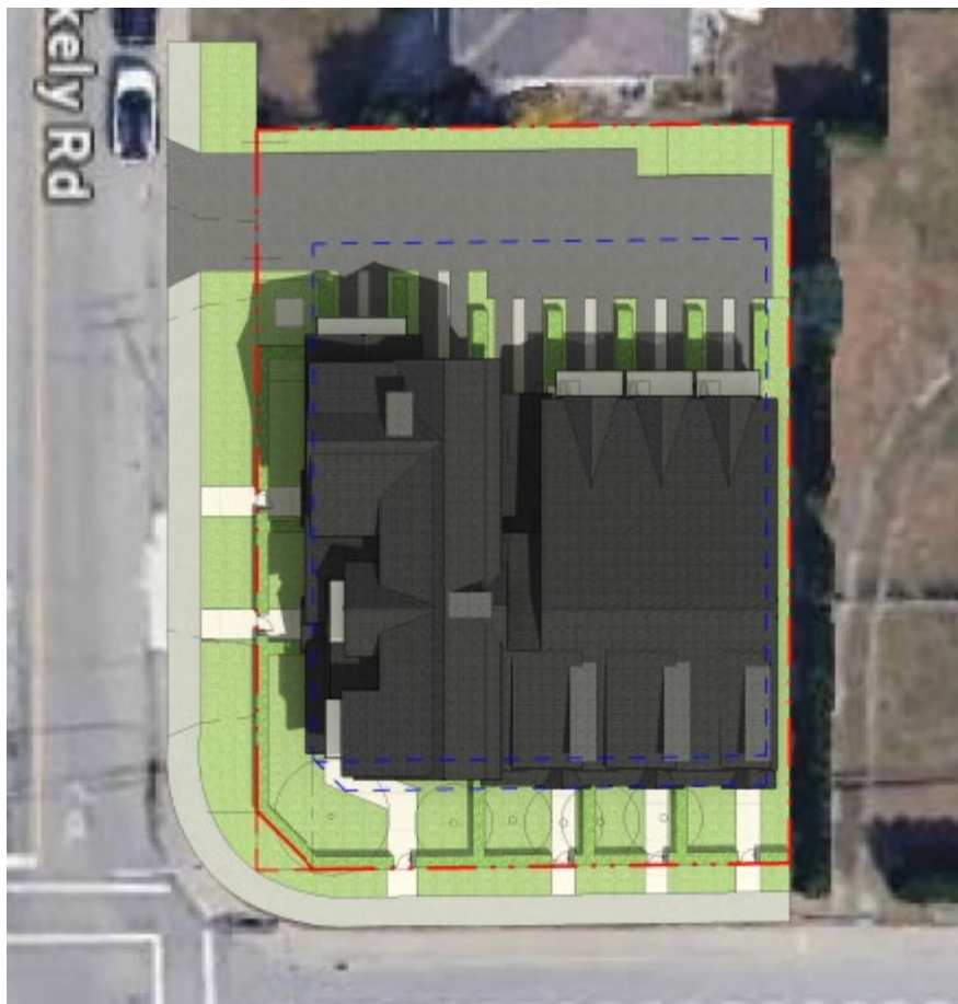
Figure 4: Conceptual site layout

Detailed plans will be submitted at the development permit stage, in accordance with the regulations set out in the R-6 zone and based on the guidelines contained in the applicable development permit area found in the OCP. This type of development permit application is reviewed by the Advisory Design Panel before Council considers permit issuance.