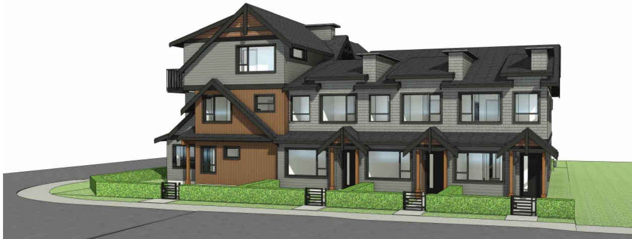
Figure 3: Conceptual rendering of proposed development

Preliminary plans have been provided, indicating that the development proposes six townhouse units, ranging in size from 1,414 ft 2 to 1,552 ft 2 of living space, each with a single car garage. Four of the units have three bedrooms, one unit has three bedrooms plus a den, and a sixth unit has three bedrooms plus a den that can be converted into a bedroom for accessibility purposes.